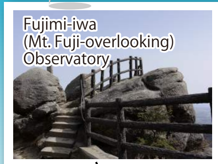
It was so named because you can see Mt. Fuji when the weather is good.