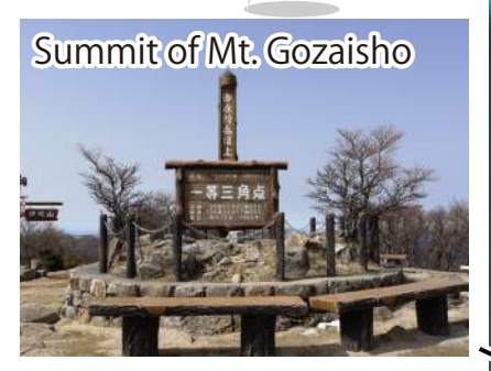
You can find the sign that marks the highest elevation point of Mt. Gozaisho, 1,212m (3,976ft)