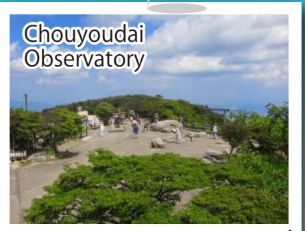
This is the nearest observatory from the Summit Park Station.